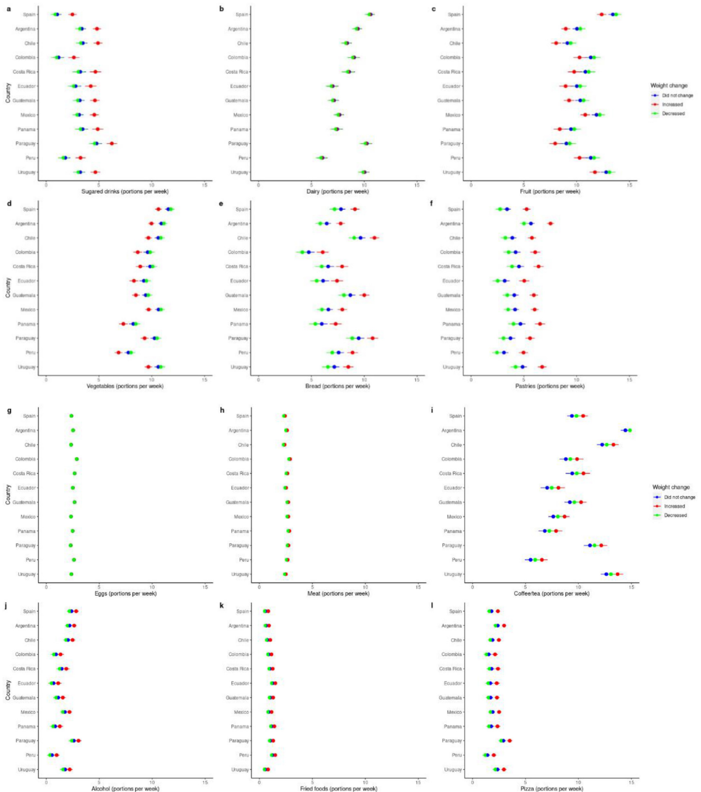
Fig. 1. Food frequency consumption by country during COVID-19 confinement.

Footnote: Adjusted mean frequencies were calculated based on coefficients of RCS's models (see Methods section). Models were adjusted by sex, age, confinement length, education level, and residence area.